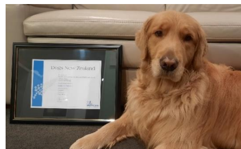
Ruger with his mail from Dogs NZ with his title certificate.

06.07.2024 Central Region Benefit Show 1, 1 st Novice B 100/100 06.07.2024 Central Region Benefit Show 2, Novice B qualifier 100/100 07.07.2024 Central Region Benefit Show 3, Novice B qualifier 99/100 24.08.2024 Tararua Allbreeds DTC Ribbon Trial, 1 st Novice B 100/100 24.08.2024 Tararua Allbreeds DTC Ribbon Trial, 3 rd Advanced A 95/100 05.09.2024 Purina Pro National Dog Show, Novice B qualifier 99/100 06.09.2024 Purina Pro National Dog Show, 3 rd Advanced A 92/100 After the Central Region Benefit Show, Jade and Ruger had achieved 3 qualifications above 90/100 and gained their RN title!!