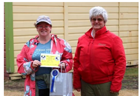
Sand Buried Hide Judges Choice