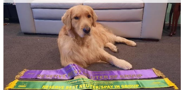
Ruger proud of his neutered reserve group ribbons

Congratulations to everyone for their achievements!