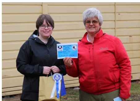
Water Buried Hide Judges Choice