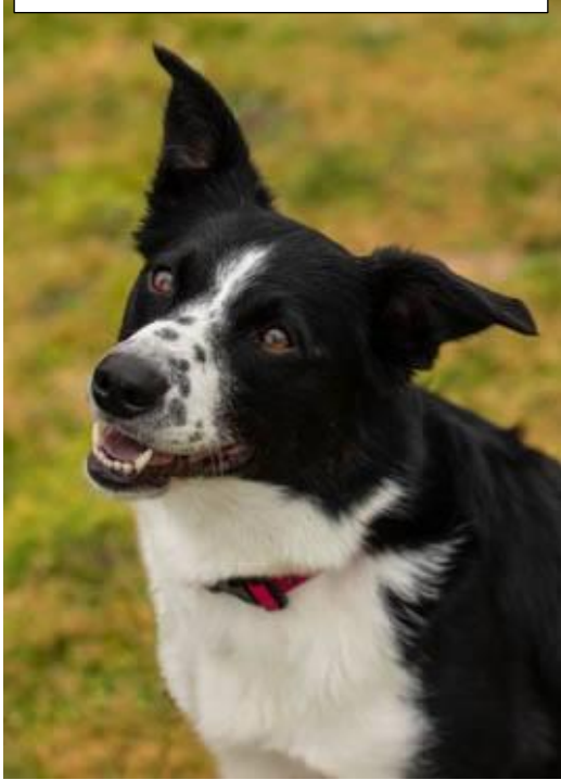
OB CH MISS IN ACTION CDXS TCQ

On Sunday the 11 th of February 2024, my little farm dog Mia became an Obedience Champion.