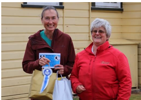
Novice Buried Hides Top Qualifier